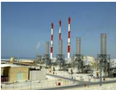
Oil & Gas Company