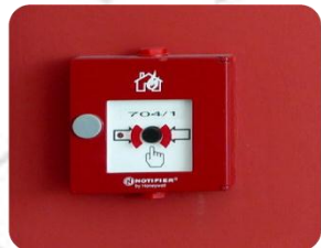
Manual Call Point