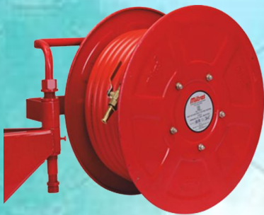
Hose Reel Drum