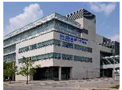
Hospitals & School