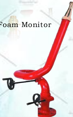
Water Foam Monitor