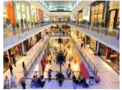
Multiplex & Shopping Mall